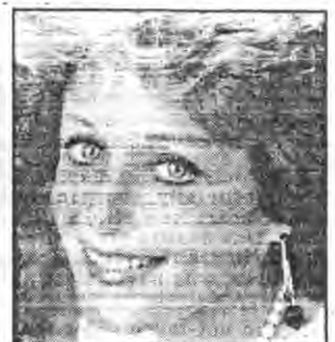
LEADING LADIES: Entertainer Eartha Kitt, left, and singer Lesley Gore offer their talents Tuesday for 'Hot Hot Tropics,' an AIDS benefit at Venus de Milo and Avalon.